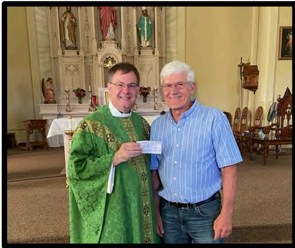
Fr. Platta Council 4735 Denmark generously donates $500 to St. James Parish for repairs and a new blacktop on their parking lot.