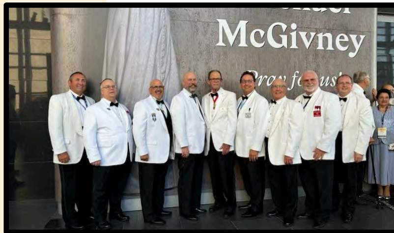
KNIGHTS OF COLUMBUS