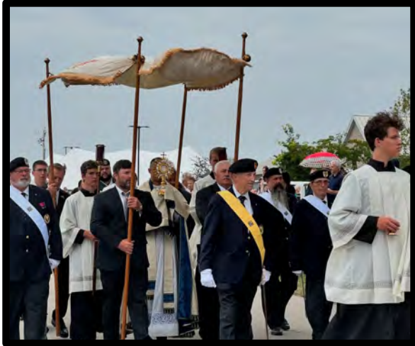
The Green Bay Diocese Fourth Degree Honor Guard from various assemblies participated in the Feast of the Assumption Mass and Eucharistic Procession.