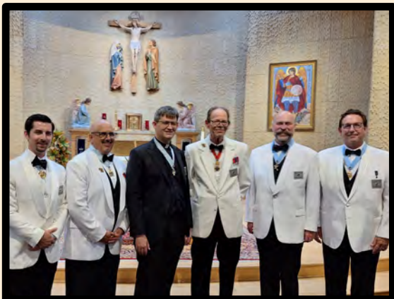
NEWLY INSTALLED STATE OFFICERS