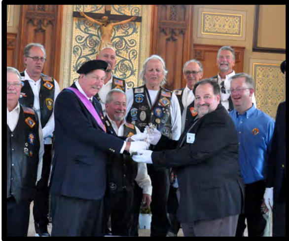
Saint Thomas Council 605 Beloit Silver Rose Handoff.