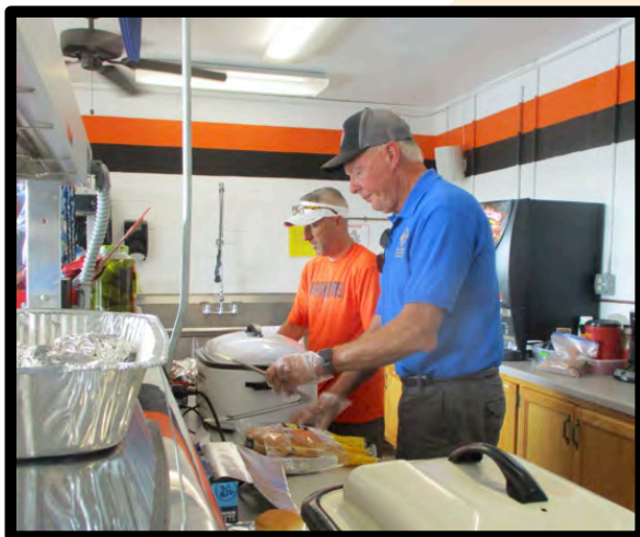
Abbot Pennings Council 3955 of De Pere showed their unwavering support by actively participating in the 7-on-7 Football Tournament held at West De Pere Football Stadium. Members and their families dedicated themselves to running the concession stand, exemplifying the spirit of community and teamwork.