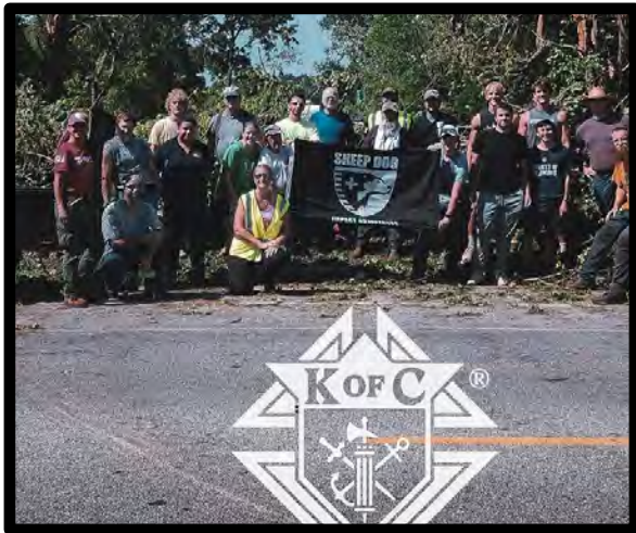
Men from the UW Madison Knights of Columbus Council and Brookfield Central Football players worked with Sheep Dog Impact assistance to clean up storm damage in Janesville.